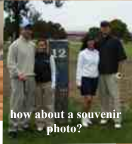
how about a souvenir photo?