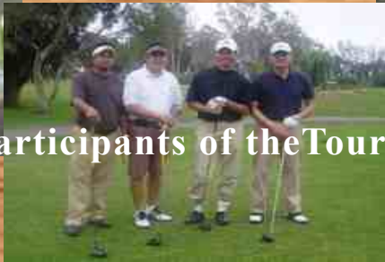
The Participants of the Tournament . . .