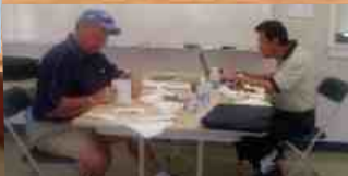
tallying the scores