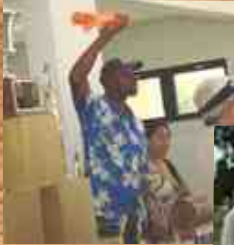
Raffle tickets anyone?