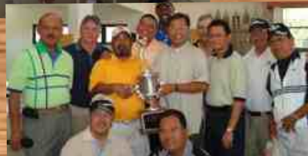
And the winners are . . .