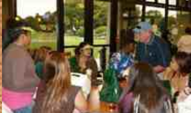
Some of the youth volunteers