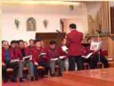
Knights of Columbus

. . . To foster and preserve solidarity among God's people."