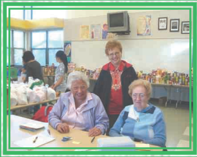
SVDPaul volunteers Being able to help.