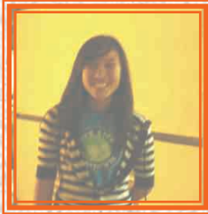
Youth/Emmaus.... this church