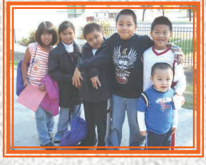
Parish Kids For Family & Friends