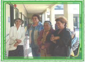
Recipients of SVDP.... Thanksgiving food baskets