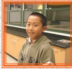
7th Grader... For my life