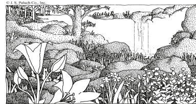
The Kingdom of Heaven Is at Hand.