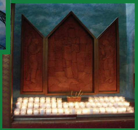
VOTIVE CANDLES FOR PRAYER OFFERINGS