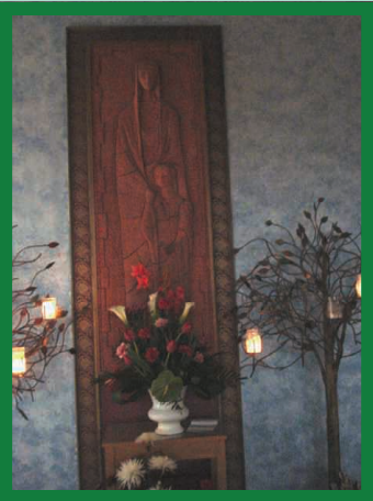
ST ANNE PRAYER AREA