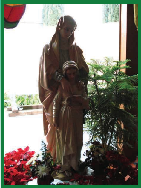
St. Anne & Mary as a Child (Statue from the Old Original Church)