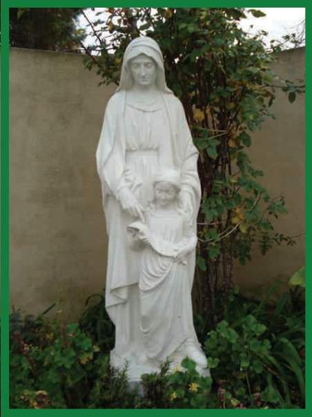
ST. ANNE 'S SHRINE