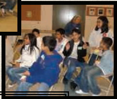
6th Grader's group activity.