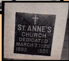
Current St. Anne & Cabello with the bell from the old church