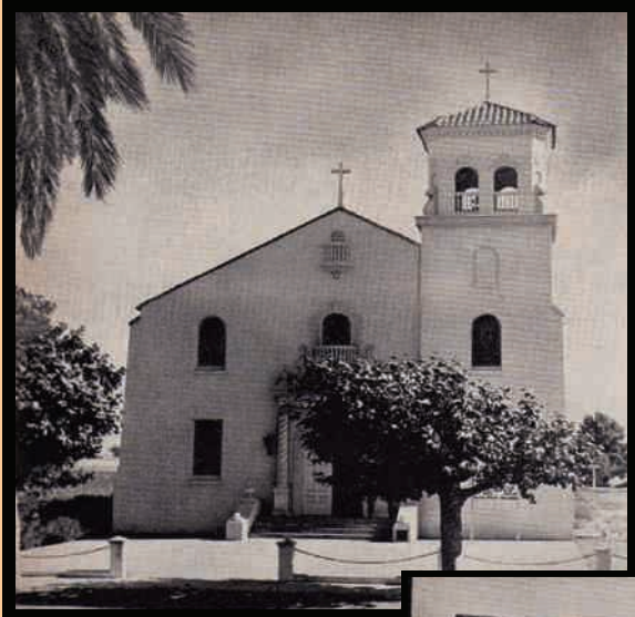
Old St. Anne & Smith St. with old corner stone.