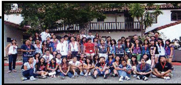
EMMAUS Peer Ministry group on their retreat and training.