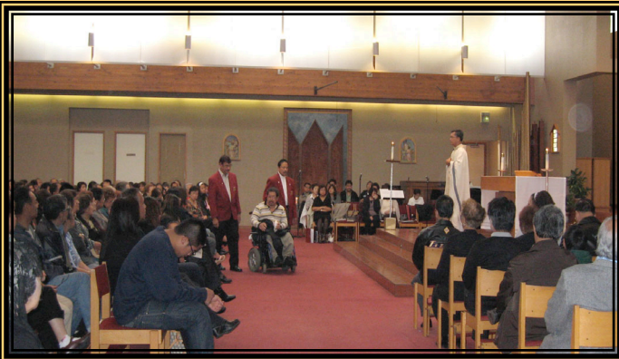
A family member offering lighted candle for a loved one is assisted by the Knights of Columbus.