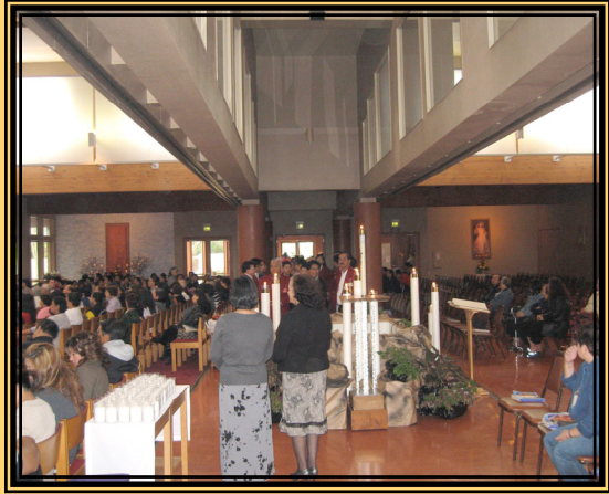
Grief Ministry members waiting for mass to begin.