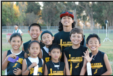
St. Anne CYO Cross Country Event—First Meet held at Joaquin Miller Park