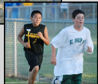
CYO at the Crown Beach #9297 meet.