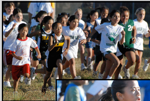
CYO Meet at San leandro Park #HFC213