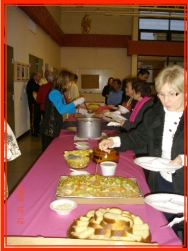
What's a celebrations without