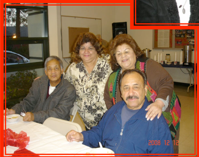
Seems like everyone was enjoying the celebration.