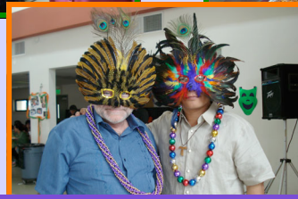
Who are these two masked characters? Can you guess???? <<<<<<<<<<<<<<<<<<<??