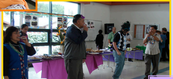
Ministry Quiz.....games with prizes were played. Fun, fun, fun!