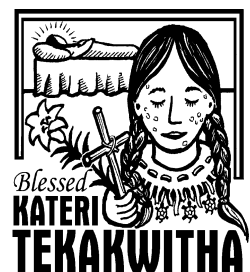
Blessed KATERI TEKAKWITHA