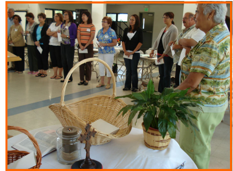
Group sharing..... prayer ritual ..... and group gathering in prayer.