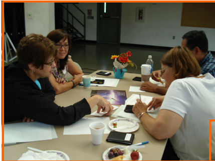
"Be A Servant First" Catechists' Retreat

September 27, 2009 Twenty-sixth Sunday in Ordinary Time