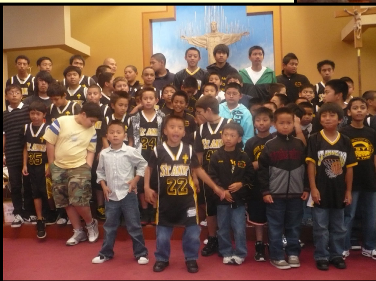
Below: Some of the CYO kids who came to support the presentation at the 5:00pm mass, Saturday -Oct.12,2009.