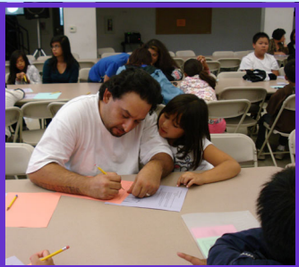
Parents and Grandparents write a "Dear God" letter while their kids try to help out.