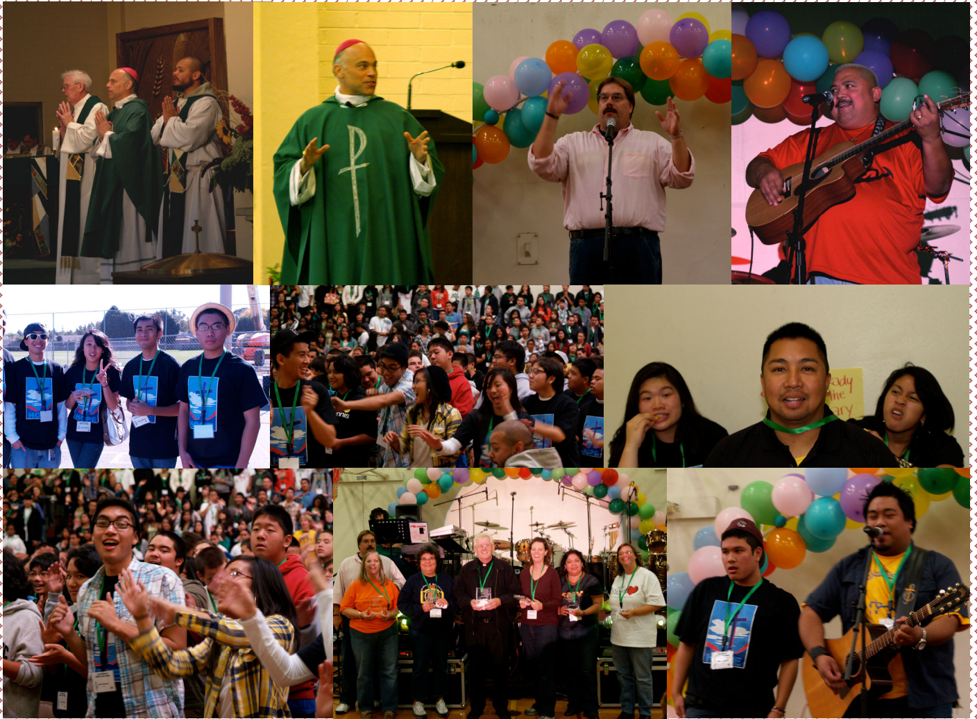
YOUTH RALLY AT ST. BEDE PARISH, HAYWARD, NOVEMBER 7, 2009