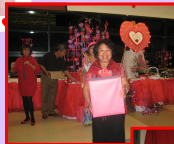
Yeh! A winner!