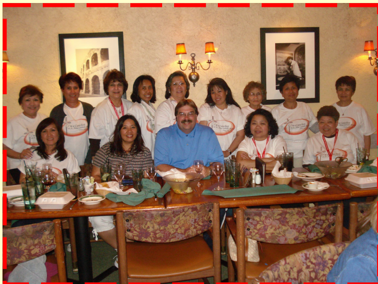
The 12 catechist who went to the LA Congress: