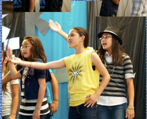
The Children's Choir performed a song and dance number.