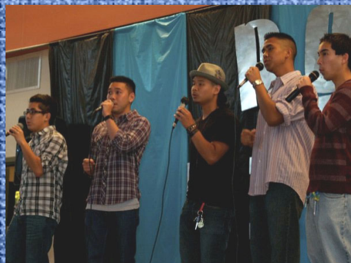
The "Looney Tunes"