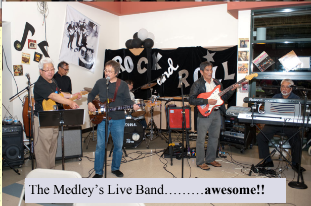
The Medley's Live Band.....awesome!!