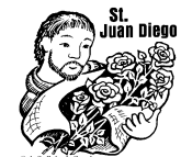
St. Juan Diego