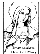
Immaculate Heart of Mary