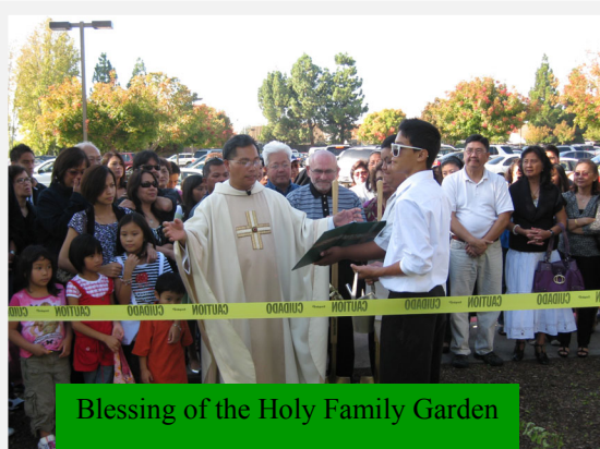
Blessing of the Holy Family Garden