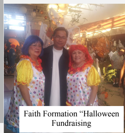
Faith Formation "Halloween Fundraising"