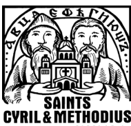
SAINTS CYRIL & METHODIUS