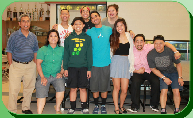
Catechists for the 8th grade