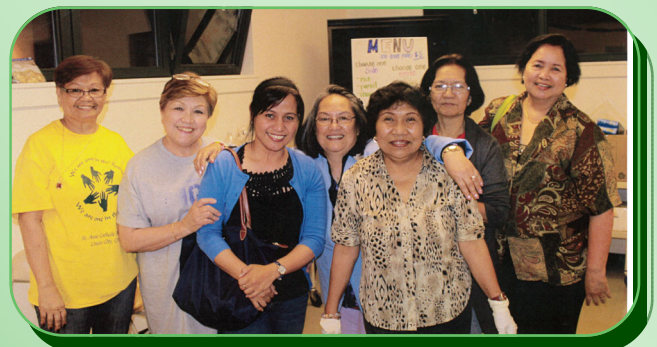
Catechists, parents, grandparents helping food sales