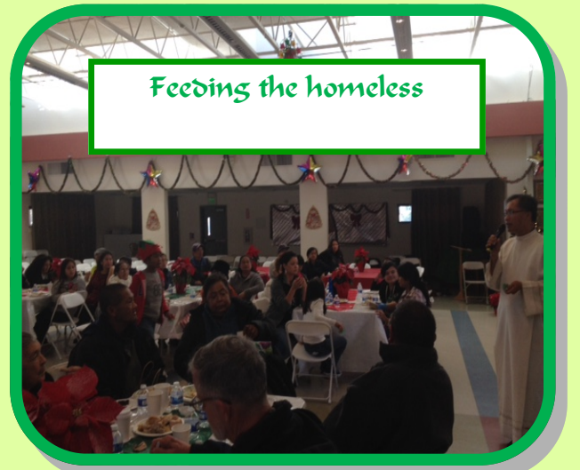
Feeding the homeless