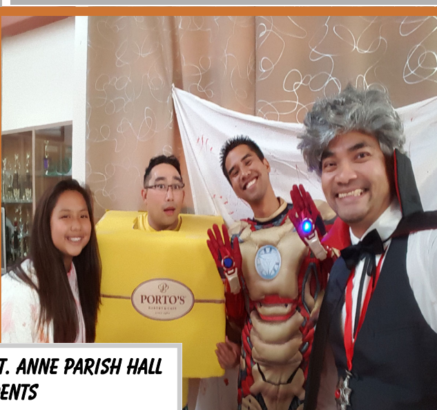
HALLOWEEN CELEBRATION AT ST. ANNE PARISH HALL WITH CCD STUDENTS