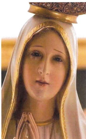
Our Lady of Fatima