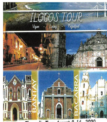
Ilocandia Tour August 8-16, 2020